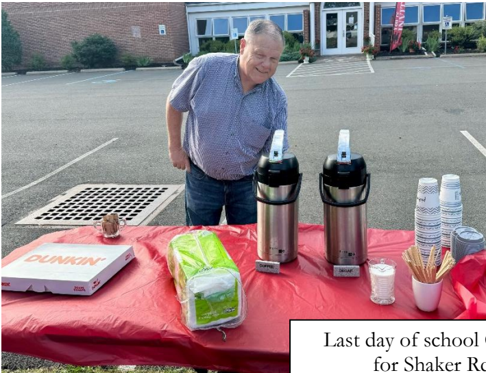
Last day of school Coffee and Donuts for Shaker Rd. Elementary