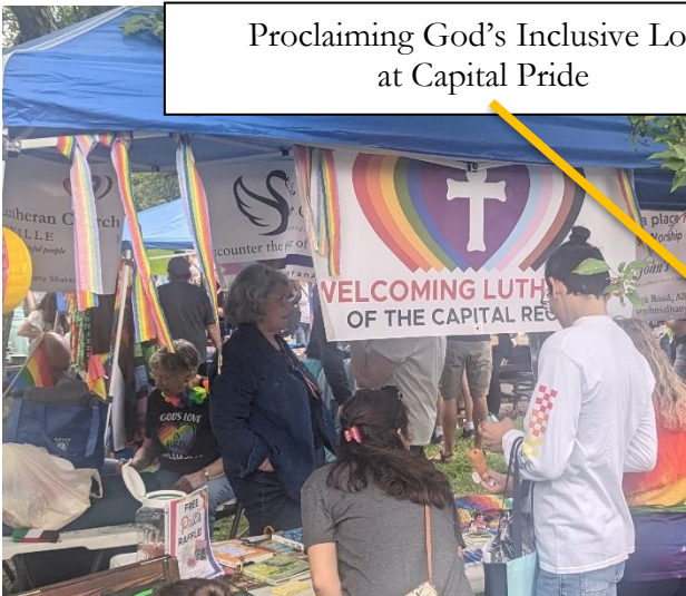
Proclaiming God's Inclusive Love at Capital Pride