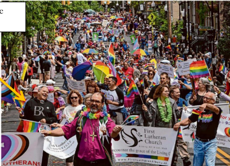
Parade marchers and attendees covered Albany's streets near Washington Park on Sunday for the Capital Pride Parade. Capital PRIDE and the Capital Pride Parade and Festival benefit the critical programs and services of the Pride Center of the Capital Region. For more photos and coverage of the event, please visit timesunion.com .