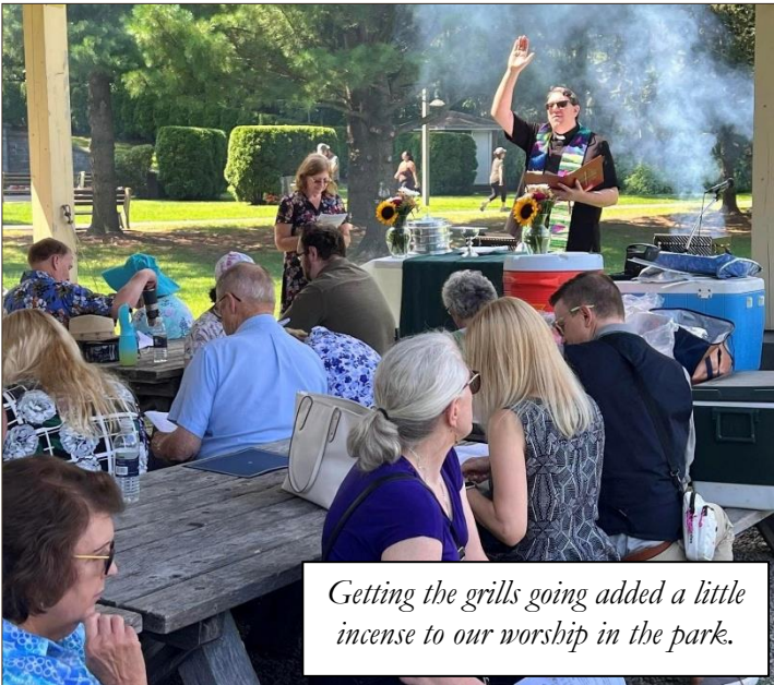
Getting the grills going added a little incense to our worship in the park.

Season of Creation ✦ PrayGround ✦ Sunday School! ✦ Prayer Walk ✦ Chicken & Biscuits