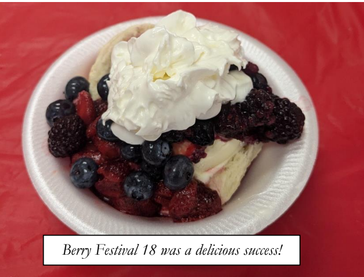
Berry Festival 18 was a delicious success!