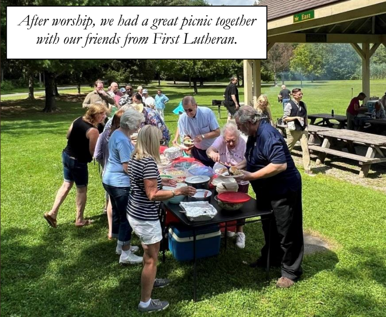
After worship, we had a great picnic together with our friends from First Lutheran.